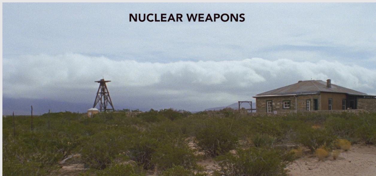
A film still from "Index:Trace"

Index:Trace portrays the past, present and future impacts of the nuclear fuel trajectory—uranium mines and nuclear weapons, power and waste—as told by impacted communities, scientists and activists who are working together for nuclear abolition and environmental justice. The filmmaker travels the 50 U.S. states to weave the story of inequality and hidden injustice. FLC students advised on entity formation for liability protection and drafted material and appearance releases.