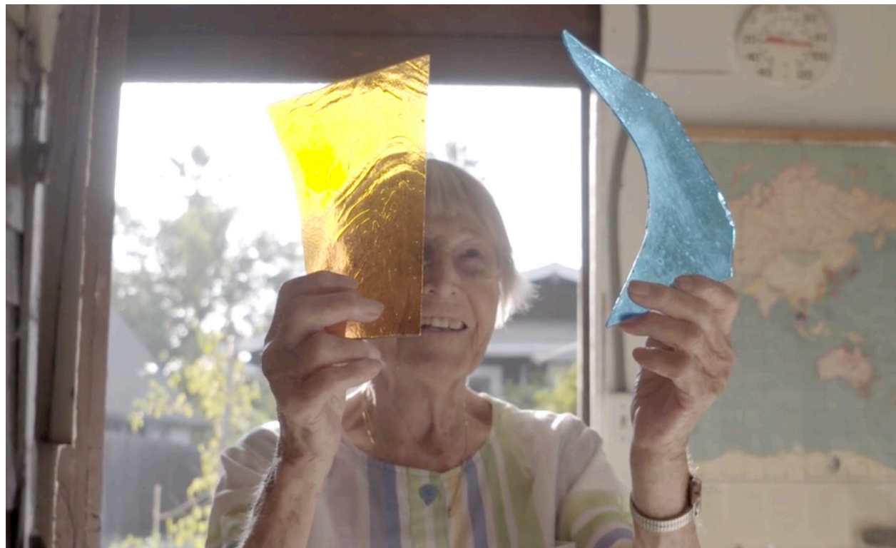
A film still from 'The Loom'

The clinic provides invaluable services to its clients, who wrestle with complex legal hurdles and limited resources while working to shed light and focus on a diverse range of some of today's most pressing issues. In the past year, projects have highlighted mental-health issues, immigrants' stories, the disproportionate disappearance of Native American women and girls, LGBTQIA+ rights, sexual and domestic violence, climate harm from nuclear waste, racial justice and toxic beauty standards.