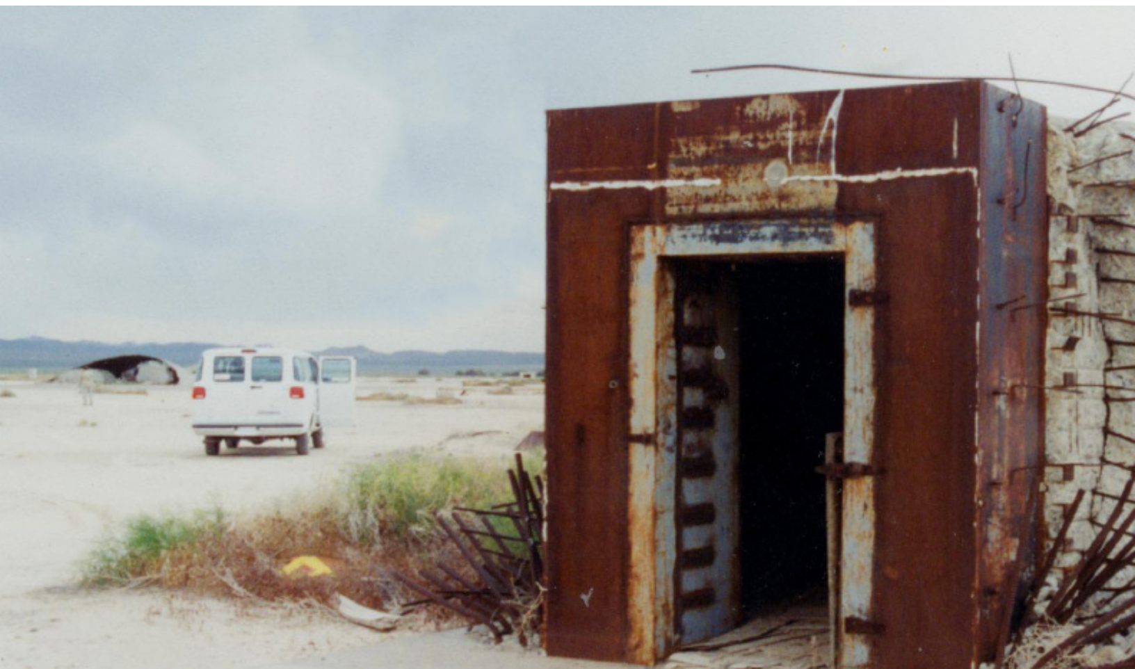
A film still from 'Index:Trace'

The FLC has benefited from the support of its partners, including the Laurie M. Tisch Illumination Fund , whose support has led to the exponential growth of the clinic, and the Legal Clinic Fund , a collaborative fund to support the growth and sustainability of legal clinics across the United States that seek to advance and defend First Amendment rights, media freedom and transparency in their communities and nationally. The fund is supported by The Abrams Foundation , Democracy Fund , Heising-Simons Foundation and The Klarman Family Foundation . The Miami Foundation serves as fiscal sponsor for the fund. The clinic is also supported by the Miranda Family Fund , the focus of which includes creating opportunities for artists of color, promoting diverse representation in all levels of government, increasing and protecting reproductive rights and building resilient systems in Puerto Rico. The clinic also appreciates the support of our alumni.