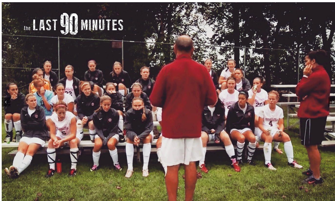
A film still from 'The Last 90 Minutes'

Visit our website here: www.filmmakerslegalclinic.org